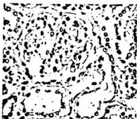
FIG. 1.—Section of kidney from the case showing a glomerulus which is apparently normal and some thinning of tubular epithelium. H. and E. \times 300 .

Similar flattening of the epithelium of the proximal convoluted tubule, suggestive of a healing lesion, occurred in case 9 of Joekes et al. (1958).